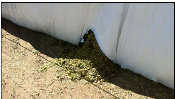
Figure 1. Silage bag ripped at the time of ensiling. Check plastic of piles and bags at the time of ensiling and throughout feedout – repair rips and holes as necessary.